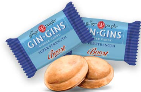
Gin Gins® Super Strength Ginger Candy