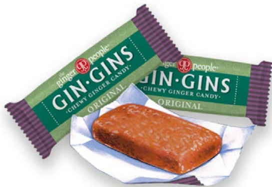
Gin Gins® Ginger Chews