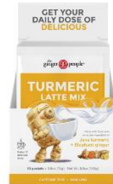
Hot Beverage Mix