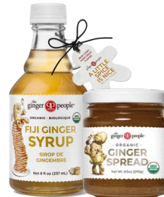
Breakfast/Dessert/ Beverage Mixer