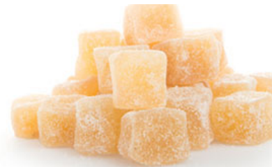
Gin Gins® Crystallized Ginger