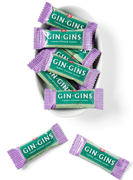
11 LBS BULK