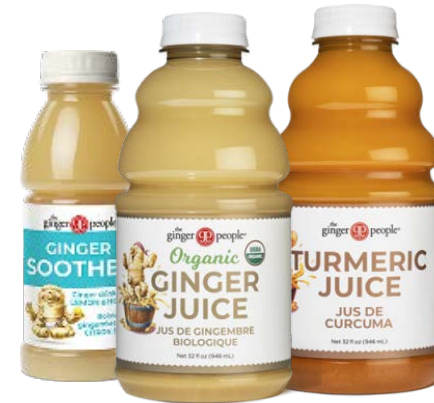
Juice (Shelf Stable)