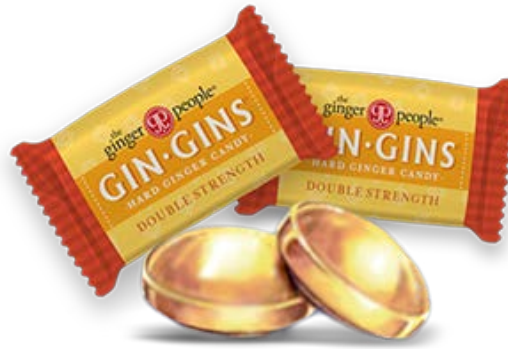
Gin Gins® Double Strength Hard Candy