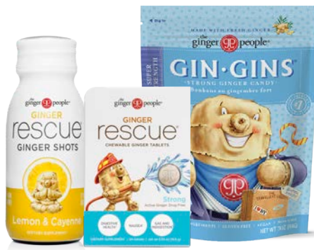
Digestive/ Wellness Aids