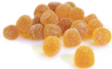
Gin Gins® Spice Drops